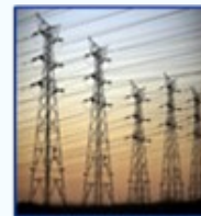
3. Power Sector Energy Efficiency