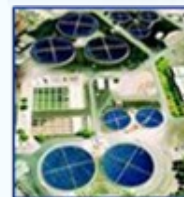
5. Municipal Infrastructure Energy Efficiency