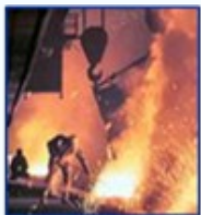
1. Industrial Energy Efficiency