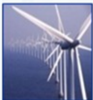
4. Renewable Energy Scale-up