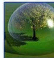
6. Carbon Markets Development