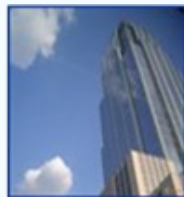
2. Sustainable Energy Financing Facilities